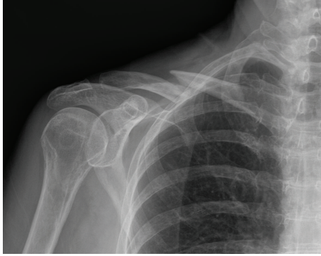
FIGURE 1: Radiograph from date of injury showing the right mid-shaft clavicle fracture. A 2.5 cm fragment is displaced posteriorly, but is not seen well in this radiograph.

the acromioclavicular, sternoclavicular, and glenohumeral joints.