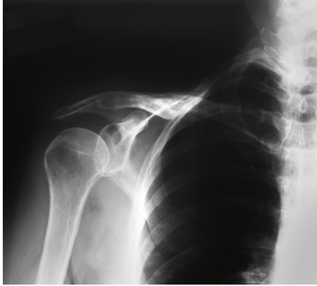
FIGURE 3: Radiograph of the healed right clavicle fracture after hardware removal.

with an intramedullary nail. Although normal sensation eventually returned, the muscle atrophy did not improve. These observations, in addition to other similar reports [17], are important in the perspective of our case because they show that fragments of mid-shaft clavicle fractures can cause injury/irritation to deeper portions of the brachial plexus.